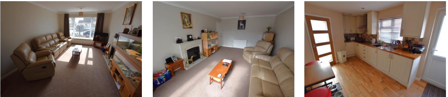
'The location is great with this semi detached bungalow as it is tucked away in a popular village location!'

This two bedroom semi detached bungalow occupies a lovely position within the cul-de-sac and has easy access to open fields and recreation spaces! Entering through the front door there is a lobby with doorway into the kitchen. The lounge is a very generous size and is light and bright, the kitchen has plenty of units and work surfaces and there is space for a breakfast table and door out to the driveway. Both bedrooms are good sized doubles and there is a conservatory which continues off bedroom two. The bungalow also has an updated, modern shower room. The property has oil CH and is double glazed.